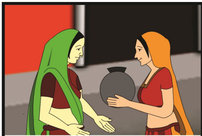
Gangaben is giving back the Pot.