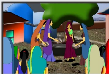
Members easily lift the stones