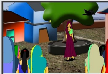
The meeting of a group starts.