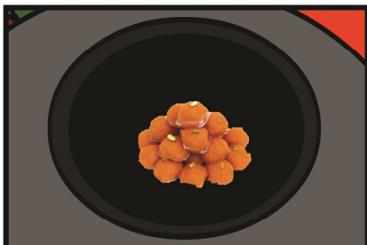
And she gets the sweet the way one gets interest from the bank.