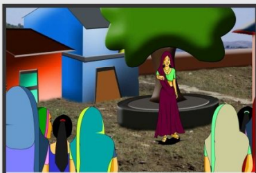
President of the group asks three members to lift small stones