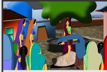
The bigger stone cannot be lifted by one member alone.