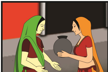
Gangaben is giving back the Pot.