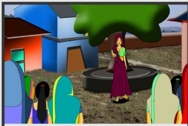
Now, the president asks three members to lift bigger stones.