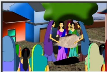
Help of other members is needed

If members choose to start lending loan from their own saving rather than seeking a large amount from a bank on credit, this will increase their financial capacity and lending capacity.